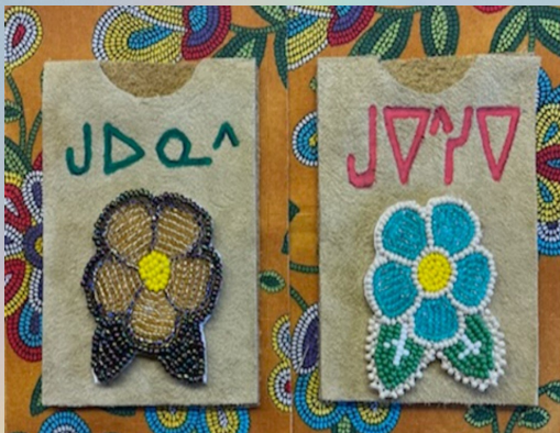
Beading done by youth

The program encourages people to accept responsibility for their behaviour and choices, leaning to problem solve and resolve conflict without violence.