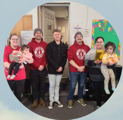
Traveling Santa: Partnered with Regina Fire Fighters

“KidsFirst gives me the opportunity to get out in the community and socialize with other parents through activities and events that they put on! Home Visitors also educate us as parents about how to ensure our babies are on track, growing, and developing as they should! They also provide supplies to families that are not always easy for us to acquire which is VERY much appreciated! I could not recommend KidsFirst enough!” KidsFirst Participant