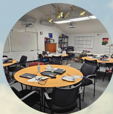
Road To Employment Classroom