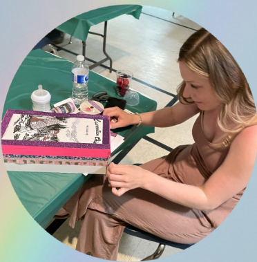
Making self care boxes at KidsFirst Graduation