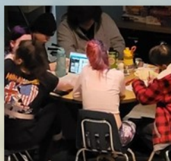
Afterschool Drop-in Activities

Funding support provided by Ministry of Justice, Community Safety and Wellbeing.