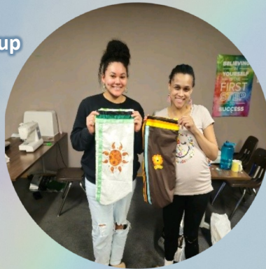
Cradle Board Teachings