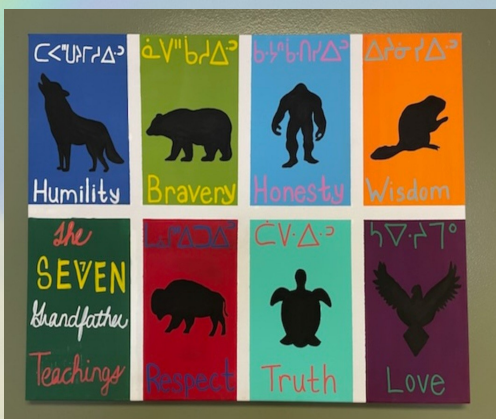
7 Grandfather Teachings

"I learned how cope with my anger in a more positive way." Youth age 16