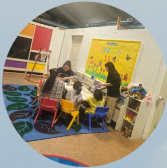
Monday Play Group

Canada Community Action Program for Children