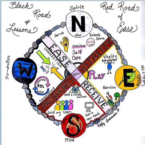
Medicine Wheel Self Development

This program works with youth who are on probation and referred through the youth court system, and community youth who are referred through caregivers and education partners.