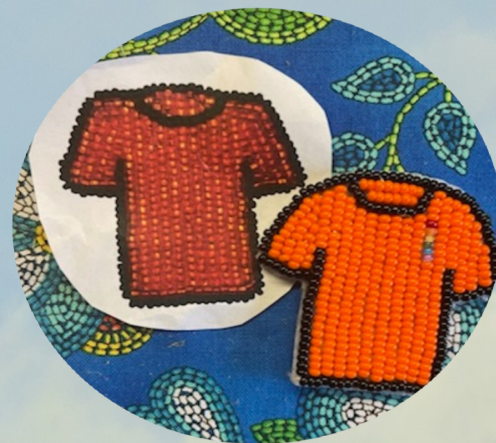
Orange Shirt Day Beading

"I learned how cope with my anger in a more positive way." Youth age 16