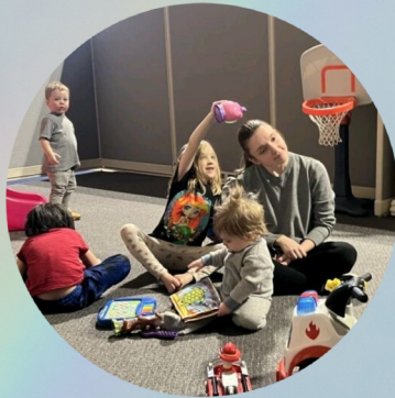
Growing Great Kids Night